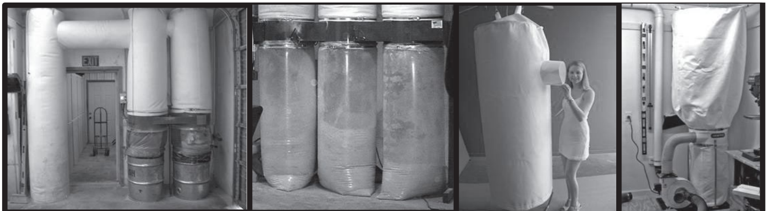
Custom Designed "Sister" Bags