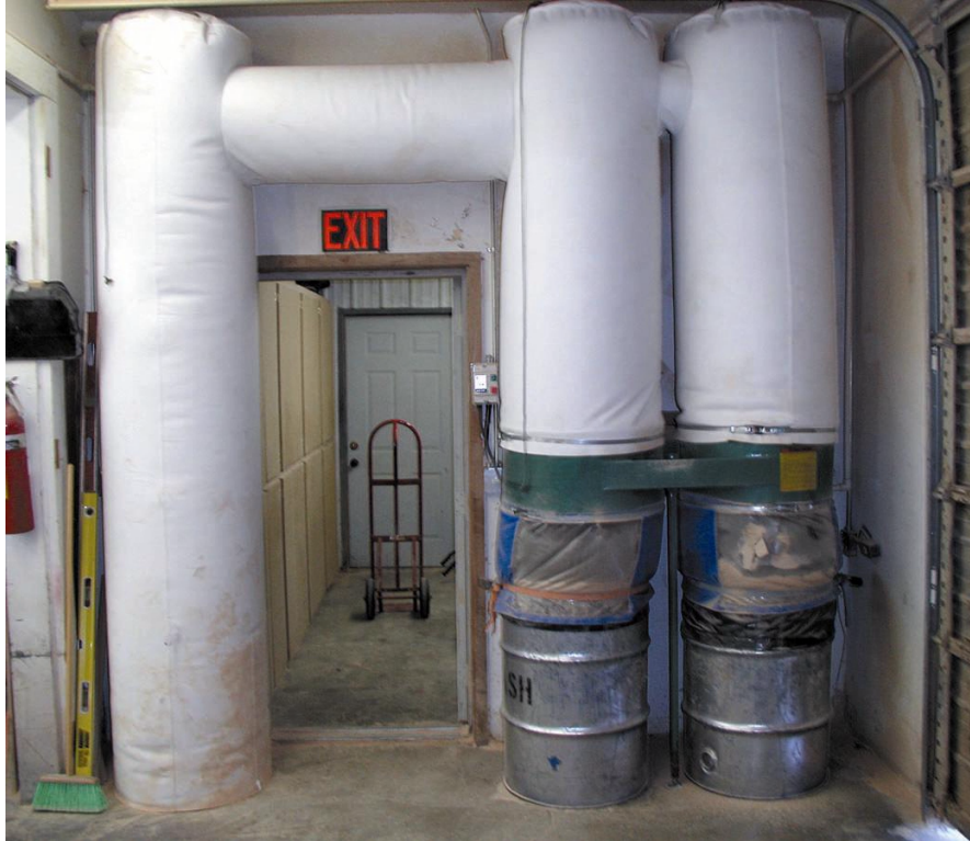
Photo Caption - Adding one "Sister" bag at left doubled the OEM's filter / breather area.

Telephone: (800) 367-3591 Fax (813) 991-9700 E-mail: info@americanfabricfilter.com