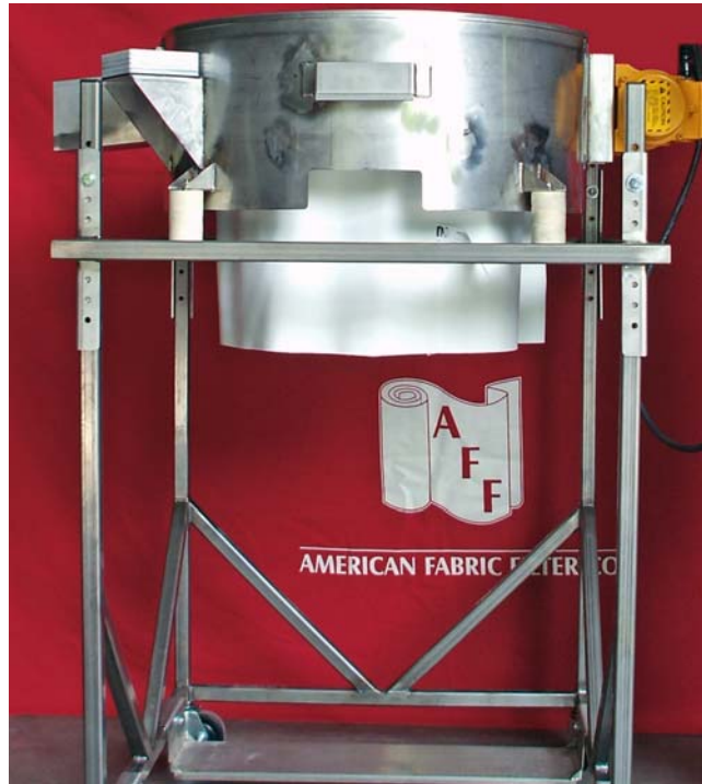
Photo Caption - PORTABLE RECLAIM SIFTER SAVES FLOUR, CUTS COSTS

Telephone: (800) 367-3591 Fax (813) 991-9700 E-mail: info@americfabricfilter.com