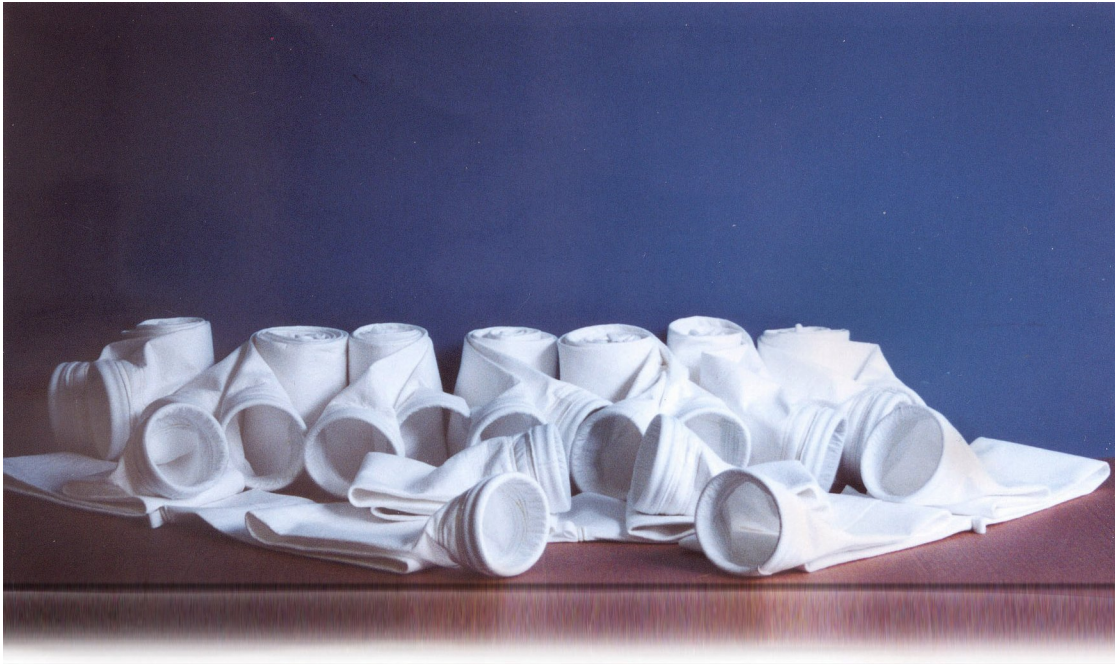
Photo Caption - Baghouse filters need periodic replacement to maintain top performance.

Telephone: (800) 367-3591 Fax (813) 991-9700 E-mail: info@americanfabricfilter.com