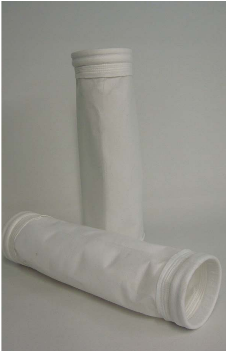
Photo Caption - Fabric filters in downdraft tables offer filtration of the finest dust without blinding and requiring minimal cleaning.

Telephone: (800) 367-3591 Fax (813) 991-9700 E-mail: info@americanfabricfilter.com